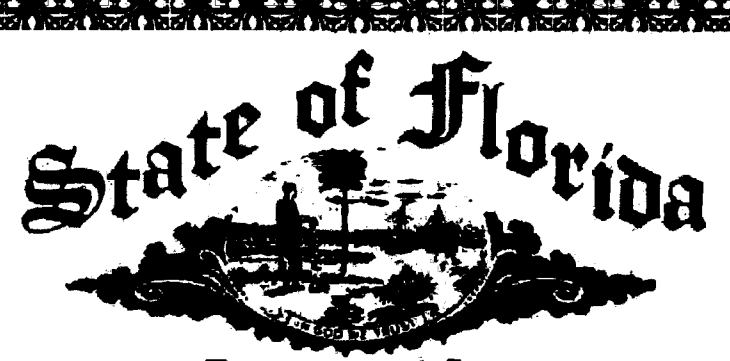
Department of State

I certify from the records of this office that VALRI PARK PROPERTY OWNERS ASSOCIATION, INC. is a corporation organized under the laws of the State of Florida, filed on October 15, 2019.